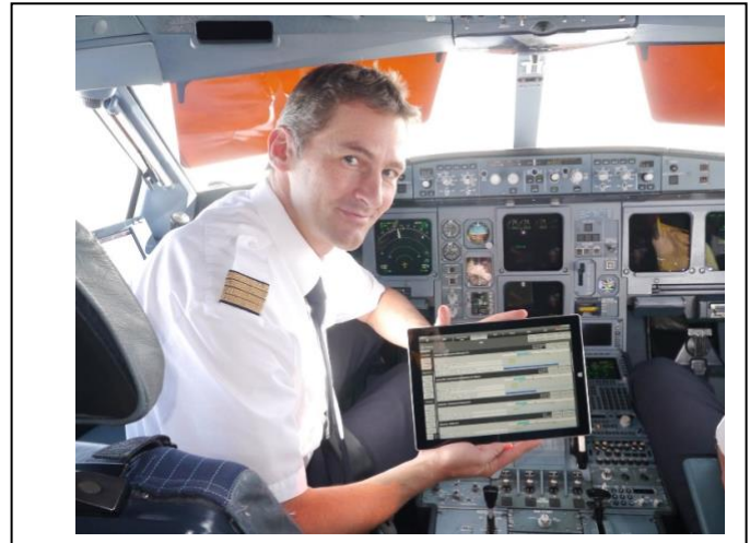
Figure 1. A portable EFB

such as fuel and time costs, passenger connecting flight values and airport delay sequence information, it offers trajectories to the pilot, which he then requests to the ATSU. Some may not have noticed it, but today, Lufthansa and other airlines, no longer wish to fly what they filed hours ago, but instead what is ideal for them NOW. The FMS, which basically showed the trajectory calculated prior to take off, no longer contains the intended trajectory. Only the EFB knows the intended trajectory. Downlinking the trajectory stored in the FMS makes no longer any sense. Downlinking the trajectory from the EFB makes all the sense. The idea of this paper is to promote this idea.